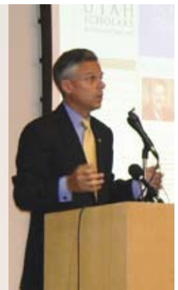
Governor Jon Huntsman

Utah kicked off its Scholars program last September with Governor Jon M. Huntsman and other notables in attendance. But even in its first year, Utah is looking ahead: in February, thanks to key support from the Salt Lake City Chamber and individual businesses, the Utah State Legislature appropriated $500,000 in one-time funds for fiscal year 2007-08 to sustain the program beyond the period of the federal grant and to facilitate its expansion to school districts across the state.